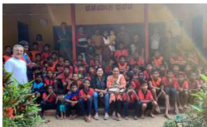
Vanayogi Bhavana - Hostel for students