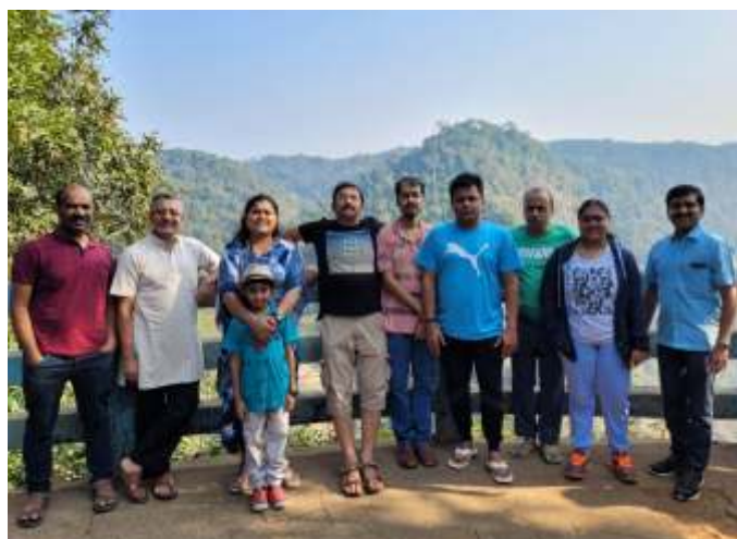
Jenukallu gudda, Sirsi