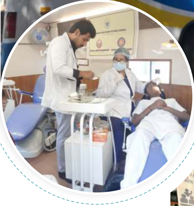
VKK Stall in RSS IT Sangama -2023 , City Engg College Grounds, Vasanthpura, Bengaluru on 11th Feb 2023.