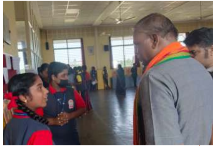
Janajati Gaurav Program