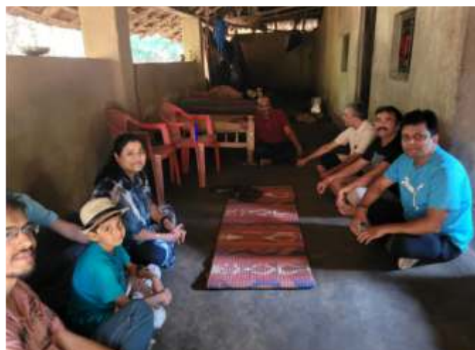
Inside a hamlet in Chipgeri in deep forest