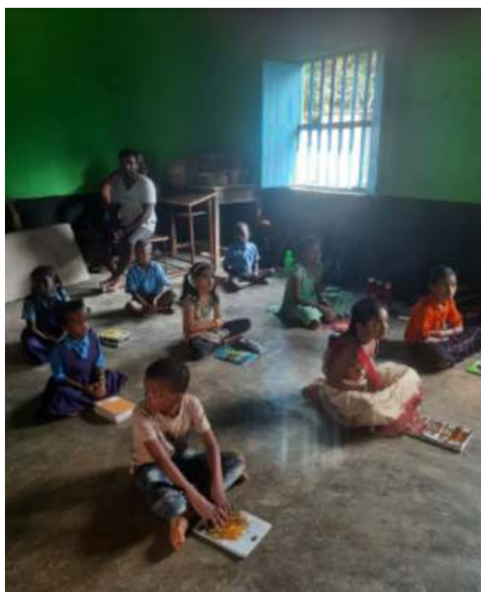
Learning Center/ Kalika Kendra